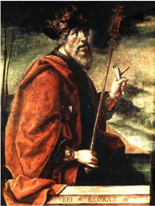
Ezra ... Priest and passionate student of the Law!!!